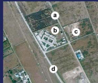
a) Land for Francisville Project b) N.P.H. hospital c) Rehabilitation Centre d) Main street to the US Embassy and to the Airport